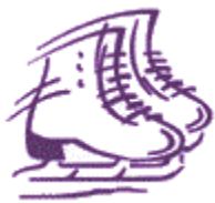
FIGURE SKATING DEALS

Print and fill out this form and fax it to: 1-604-264-9206